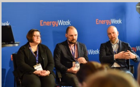
Bothnia Green Energy project's seminar on EnergyWeek.

The Bothnia Green Energy project (BGE) organised a seminar related to energy solutions in buildings on March 13th, 2025, during EnergyWeek in Vaasa.