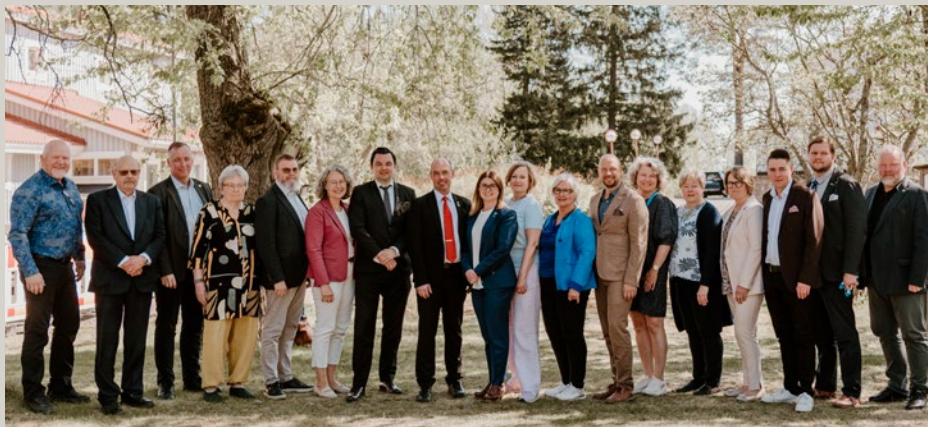
The Kvarken Council's board at the annual meeting in Kokkola.

The Kvarken Council, in collaboration with the Finnish-Swedish Chamber of Commer-