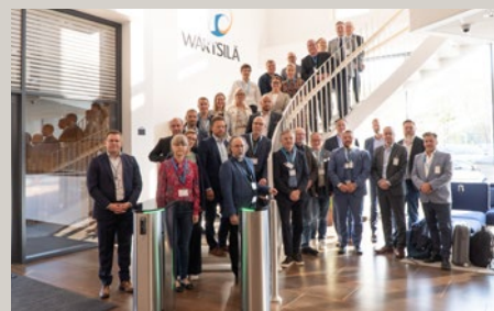
The Kvarken Council's study visit for the Transport Infrastructure Agency's working group to Umeå and Vaasa.

perspective to ensure the planned connection meets both local and national needs in Finland and Sweden.