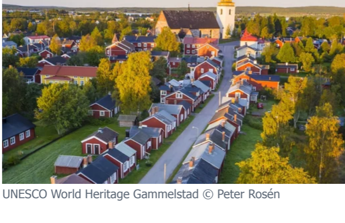
UNESCO World Heritage Gammelstad

Travel comfortably and eco-consciously with Wasaline between Umeå (SWE) and Vaasa (FIN) . This ferry is the first CO 2 -neutral passenger vessel in the Baltic Sea and has connected the two dynamic twin cities since the 1940s.