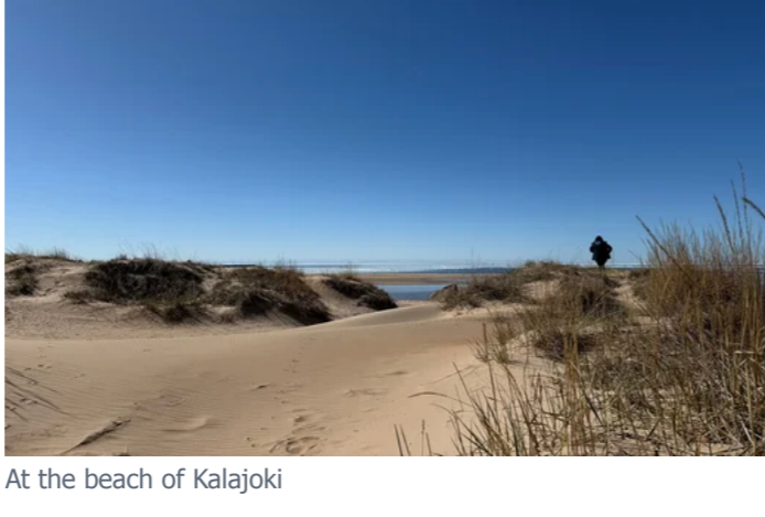
At the beach of Kalajoki

Nature, culture, and sustainability combined on one unique coastal route